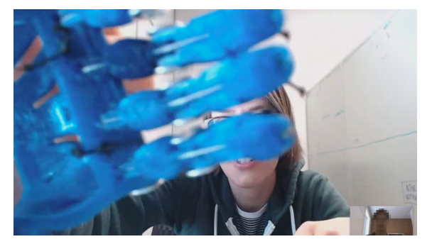
Figure 8. P18(VC) holds the blue prosthetic hand close to the camera in an attempt to show details of the fingertips. Unfortunately, the webcam remains focused on the P18; the image of the prosthetic is blurry to the viewer. "I don't know if you can see the surface texture."

example, P12(VC) held the prosthetic too low to be in the camera view, and remarked, " Ah , I don't know where the camera is, " before readjusting their position and lifting the hand back into frame.