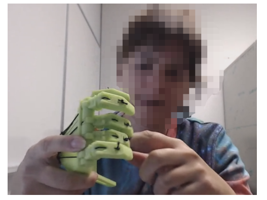
Figure 5. P5(VC) shows how the prosthetic behaves, discussing string tension and joints. "If I'm closing this one and I touch it like this, they kind of bounce around a bit."

their collaborator a better view (Figure 4), and finally resumed individually examining the hands.