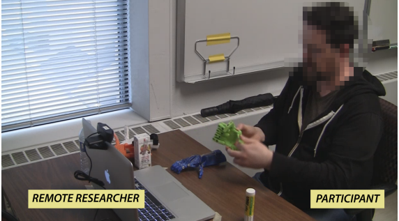
Figure 1. Participants (here, P13) critique prosthetic hands for a researcher while (Top) sitting face-to-face across from the researcher, and (Bottom) using a webcam to video conference with a remote researcher.

RepRap Project <sup>2</sup>), or prosthetic limbs (e.g., e-NABLE <sup>3</sup>). While shared CAD models capture the intended geometry of a design, they cannot answer questions about how a design performs in the real-world. Thus, these designs are physically produced by the community—individual designers, makers, enthusiasts, or end-users—for design feedback. The community then uses off-the-shelf video conferencing systems to virtually meet and share prototype feedback. However, standard video conferencing tools are not necessarily equipped to convey the material experiences that inform physical prototype critique. How should remote collaboration technology support people as they critique physical artifacts?