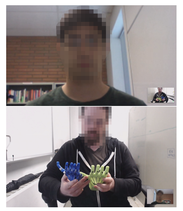
Figure 2. (Top) The view that the participant sees on their computer. The small bottom right corner shows a preview window of the participant's camera. (Bottom) The view on the collaborator's screen. The small bottom right corner shows a preview window of the researcher.

Finally, after completing both conditions, participants responded to a questionnaire asking them to describe any dif-