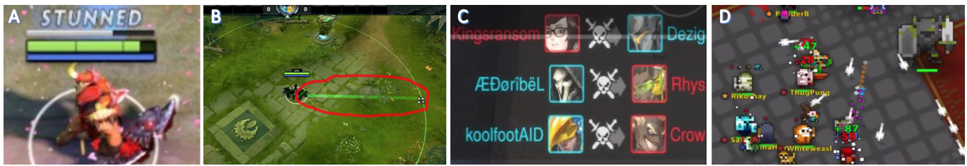
Figure 3. A: “Stun bar” showing when an effect will finish in Dota2 [G23]. B: A visualization of the future range of a spell in Dota2 [G23]. C: “Kill feeds” in Overwatch [G6]. D: Status awareness cues over embodiments in Realm of the Mad God [G24].

views 3 ; and, third, through abstract widgets such as icons on a compass. For example, in PlayerUnknown’s Battlegrounds [G7] players can see map markers for their teammates in a compass at the top of the screen (see Figure 5.C).