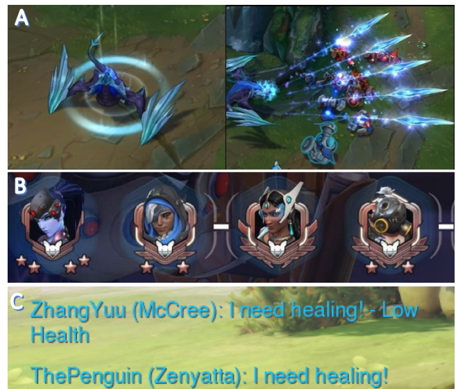
Figure 2. A: Characteristic visual effects of different embodiment actions in LoL [G17]. B: Character icons in Overwatch [G6]: the borders represent player experience while silver icons represent skill. C: Automatically amended chat messages in Overwatch [G6] indicating of the severity of a player’s request.

There is, of course, much that can be conveyed about activity through an embodiment—for example, where an embodiment is (and where they are going) in the gameworld gives strong clues as to a player’s destination and task (particularly in games that are oriented around location-based objectives); similarly, what equipment they are holding (e.g., a sniper rifle) and what they are doing with that equipment (e.g., shooting) clearly shows their current activity. In addition, many games’