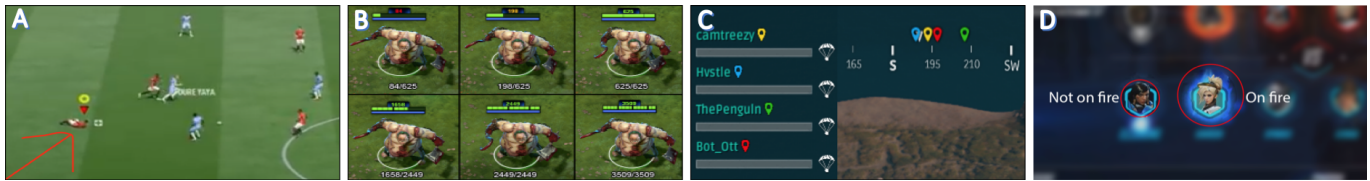
Figure 5. A: Avatar allegiance is shown by the characters clothing color in FIFA 17 [G11]. The arrow is pointing to a diegetic representation of status, low health/injury in this case. B: The dynamic nature of HP bars found in Dota 2 [G23]. C: In PUBG [G7] squad-mate HP bars, activity icons (parachuting) and waypoint colors are shown on the left while the center-top of the players screen shows a compass with the directions of their teammates waypoints. D: Player perception indication in Overwatch [G6] via a on-fire border animation. In this case it shows that the player is performing well.

event [4,5] (e.g., a teammate moving close by is represented by a unique character-specific footstep sound in Overwatch [G6]). Earcons are abstract sounds whose characteristics are varied corresponding to the underlying data they represent, so they can be used to build complex notifications [4, 5]. Learning to identify and make effective use of audio representations is challenging, but useful, for players [34].